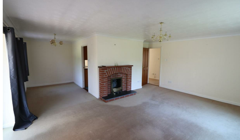
CREED LANE, GRAMPOUND £1,100 PCM